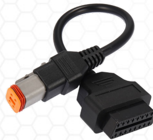
Harley 4 pin