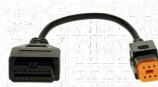
Harley 6 Pin