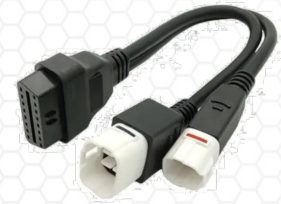
Suzuki 4+ 6 Pin