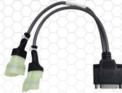
Kawasaki 4+ 6 Pin