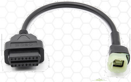
Honda 4 pin

Coverage Manufacturer: Honda, Yamaha, Kawasaki, Suzuki, Harley-Davidson, BMW Supported Device.